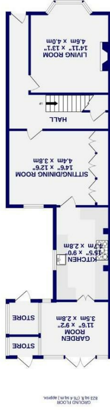
GROUND FLOOR 822 sq ft (76 sq m) approx.